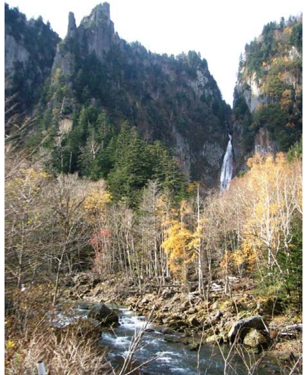
Ryusei Waterfall (Kamikawa Town, Hokkaido)

It is necessary to make the quality, quantity, temperature and pressure of groundwater sound to utilize groundwater as one of our resources.