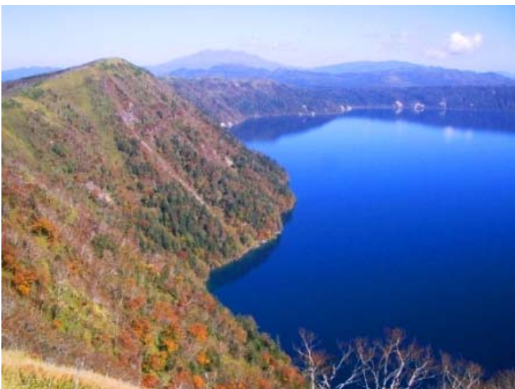
Lake Mashu (Teshikaga Town, Hokkaido)

A sound water cycle should be considered on the scale of the catchment basin and from a worldwide viewpoint, not from the administrative border and regional level.