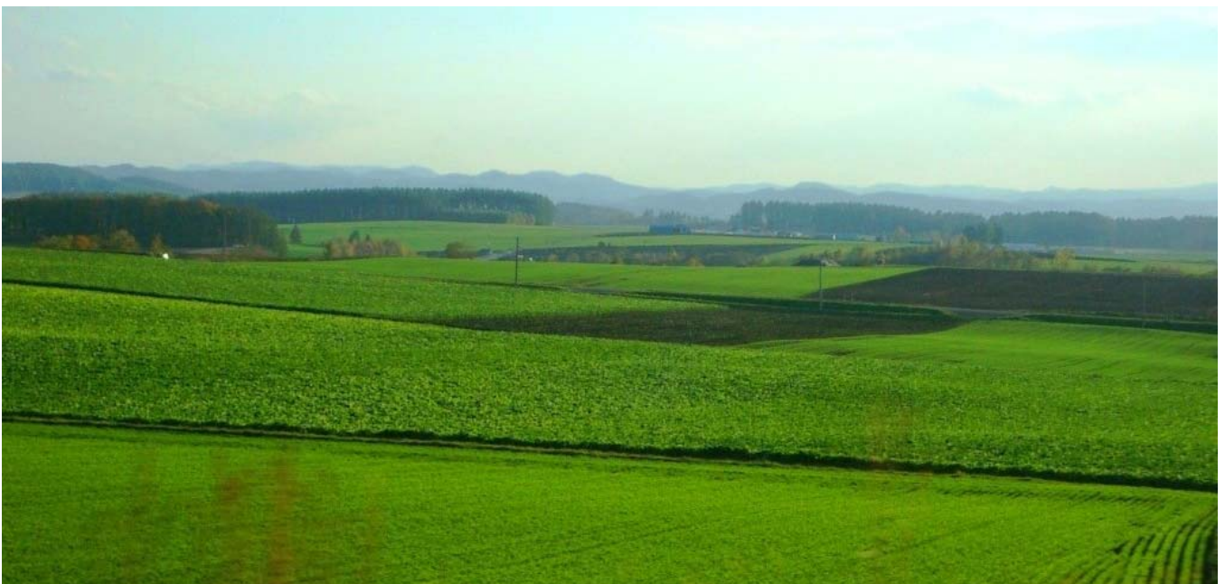
Rural landscape (Kitami City, Hokkaido)